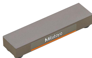
601645 100 (W) x 25 (D) x 12 (H) mm