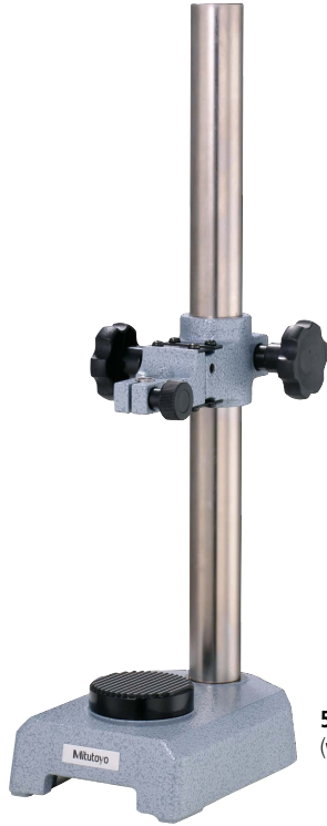
519-109-10 (with a serrated anvil)