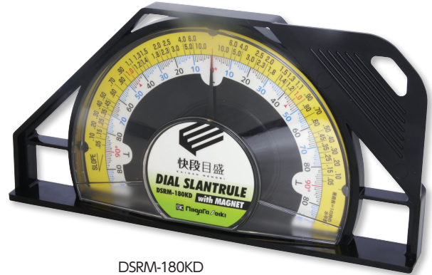
DSRM-180KD (with magnet)