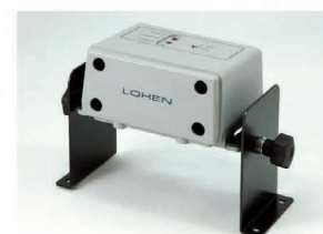
"No wind" Ionizer

* Not available to use in EEA, Switzerland & Turkey.