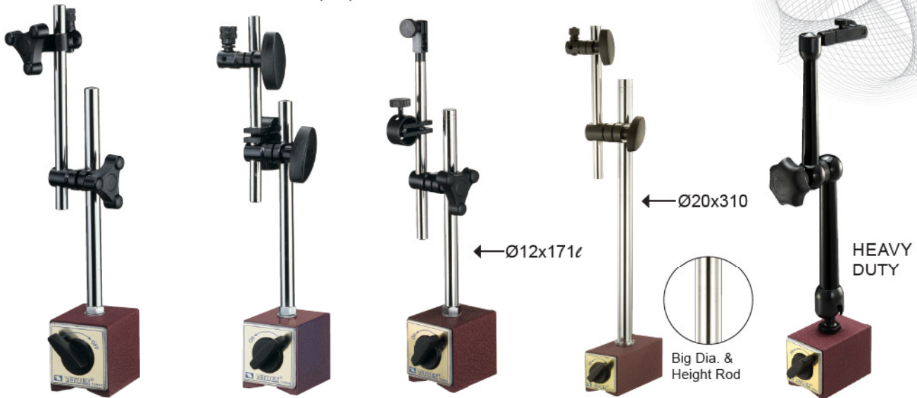
ORDER NO. VMB-B MAGNETIC BASE /80kgs

FIXED ARM TYPE VMB-B,01,02 THE DIAL CLAMP HOLE Ø6.5 & Ø8