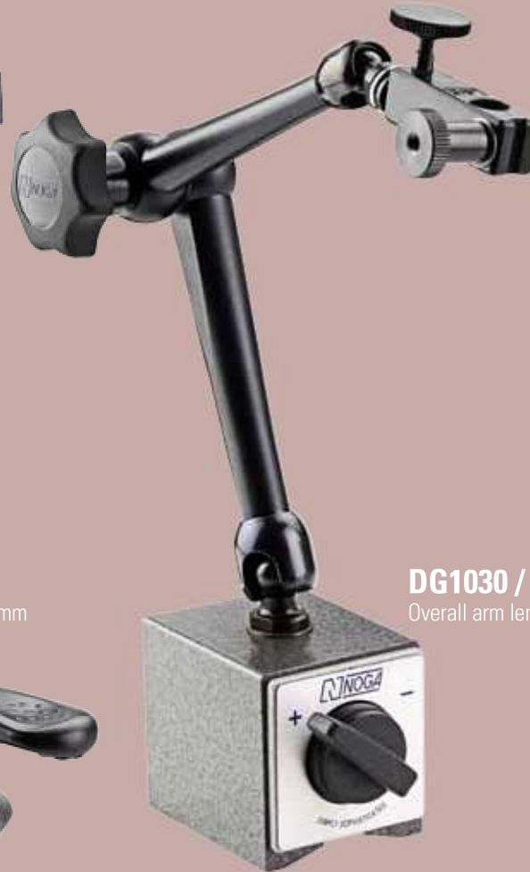
DG1030 / DG1033 Overall arm length 261 mm