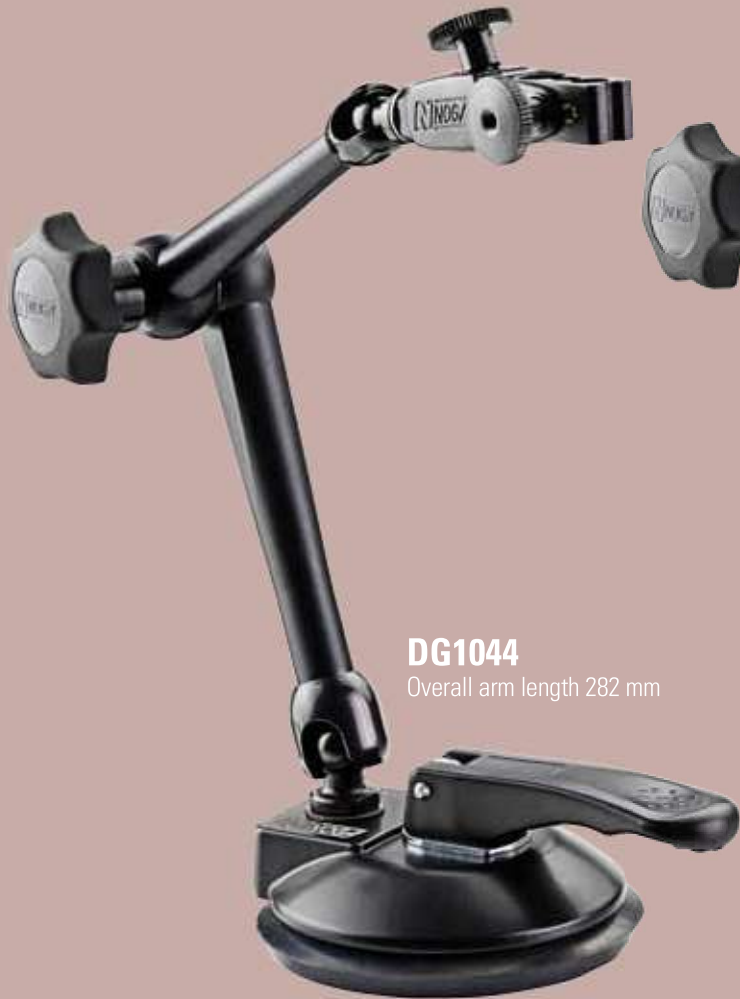
DG1044 Overall arm length 282 mm