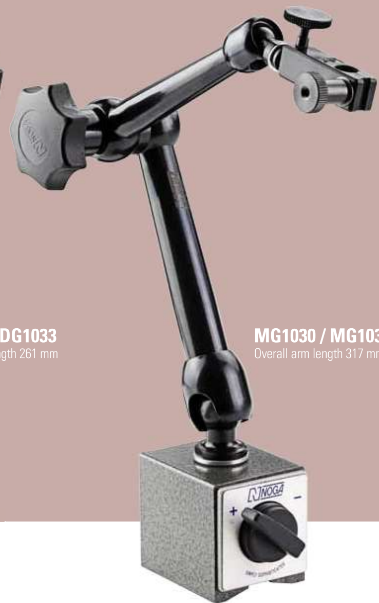
MG1030 / MG1033 Overall arm length 317 mm