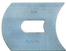
179型 (179 Type)