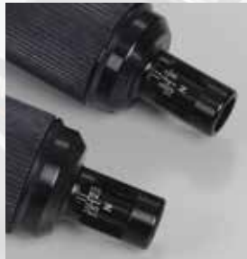
Above: 2 to 10 N type Below: 0.5 to 2.5 N type

Digimatic micrometer dedicated to applications requiring a constant/low measuring force such as measuring wire, paper, and plastic/rubber parts.