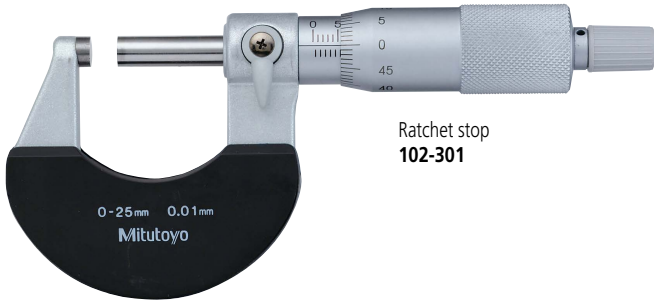
Ratchet stop 102-301